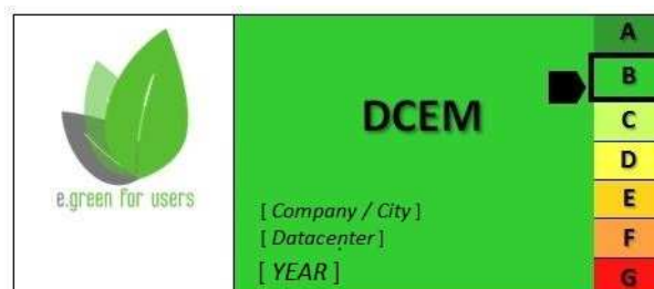
The 9 levels of eco efficiency of ICT sites

The most performant current ICT sites are rated B or C.