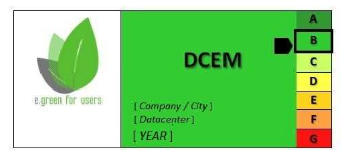
(*) ETSI ISG OEU: Industry Specification Group Operational Energy Efficiency for Users.