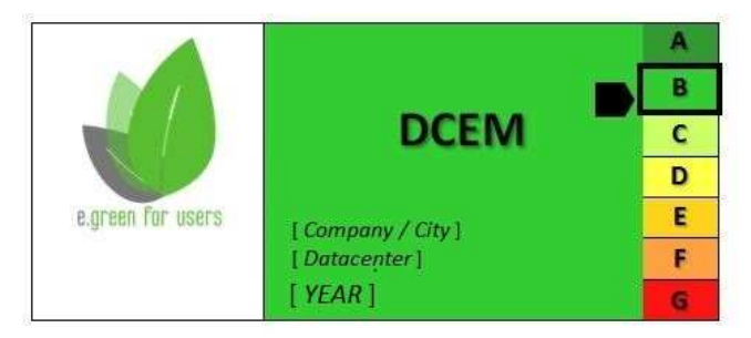
(*) ETSI ISG OEU: Industry Specification Group Operational Energy Efficiency for Users.